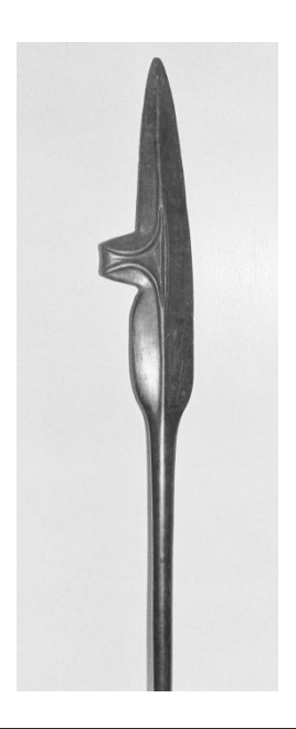
Head of club of wood, Pentecost, Vanautu, National Museums Scotland