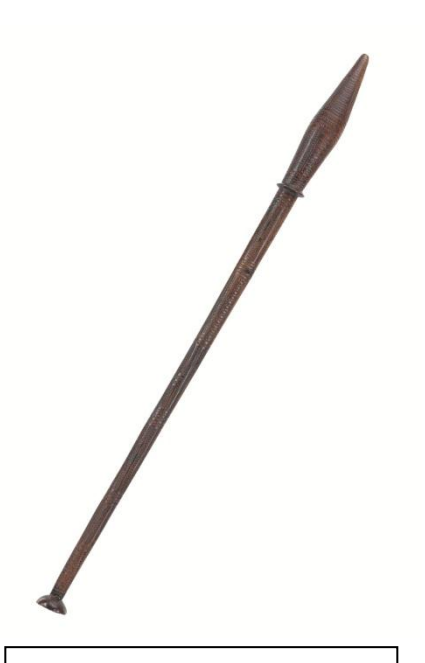
Club of wood, Erromango, Vanautu, National Museums Scotland (A.1892.355)

Wooden clubs from Erromango usually terminate in a flattened flared butt carved with a flower motif that echoes designs used on Erromangan backcloth.