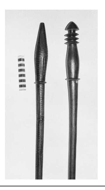
Head of two clubs of wood, Erromango, Vanautu, National Museums Scotland