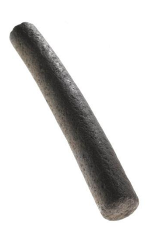
Throwing stone ( kawas ), Tanna, Vanuatu, 19<sup>th</sup> century, National Museums Scotland (A.1889.524)

Throwing weapons ( kawas ) of stone or coral were also used in south Vanautu. These are about a foot in length, cylindrical in shape with a diameter of around 3 centimetres.