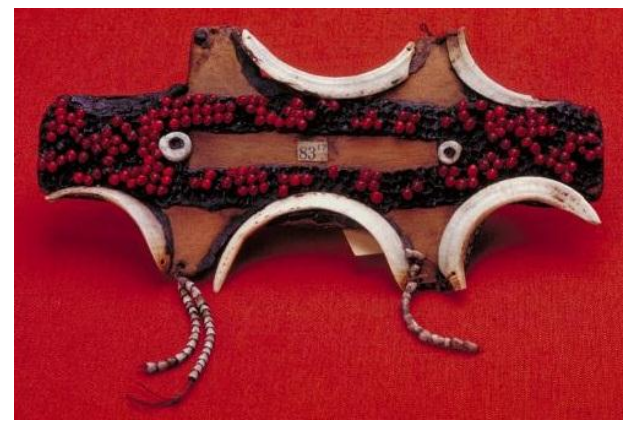
Musikaka , South East Papua New Guinea, 19<sup>th</sup> century, University of Aberdeen Museums (ABDUA: 146)

Face ornament or fighting mask ( gibigibi ), Papua New Guinea, 19<sup>th</sup> century, University of Aberdeen Museums (ABDUA: 133)