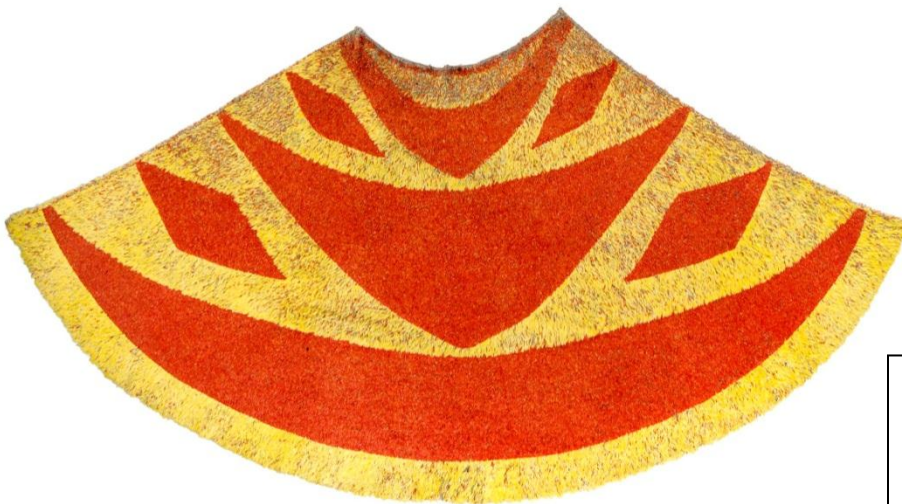
Chief's feather cloak, Hawaiian Islands, early 19 th century, National Museums Scotland (A.1948.274)

The use of featherwork in Hawaiian material culture is of particular note. Hawaiian cloaks of red and yellow feathers which came from honeycreepers unique to the islands are distinctive. Yellow indicated a person's political power and red, as in other areas of the Pacific, was a signifier of sacred power. Hundreds of feathers were attached to a base of knotted olona plant fibre to form bold geometric patterns.