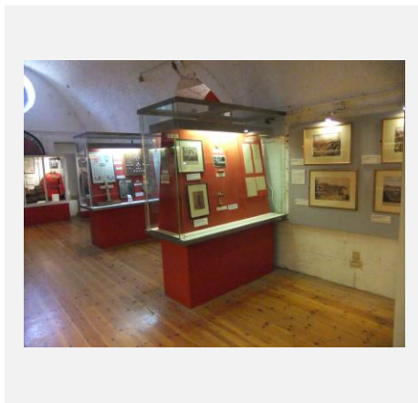
Display relating to North America