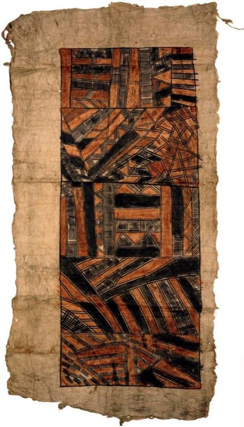
Barkcloth from Tahiti, Society Islands, 18 th century, National Museums Scotland (A.UC.442)

Barkcloth is a soft felt-like material made from the beaten bark of a tree, usually paper mulberry. At one time it was made across the Pacific however the increased availability of cotton cloth impacted on production in the 19 th century. The term tapa is often used interchangeably with the word barkcloth but there are many local names specific to different cultural areas. Barkcloth continues to be made in some areas today and is used in work by contemporary Pacific artists and fashion designers.