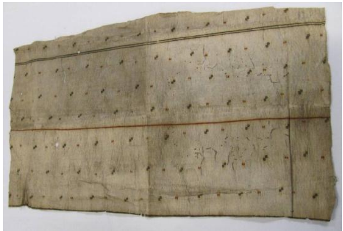
Barkcloth ( kapa ) from the Hawaiian Islands, National Museums Scotland (A.UC.391)