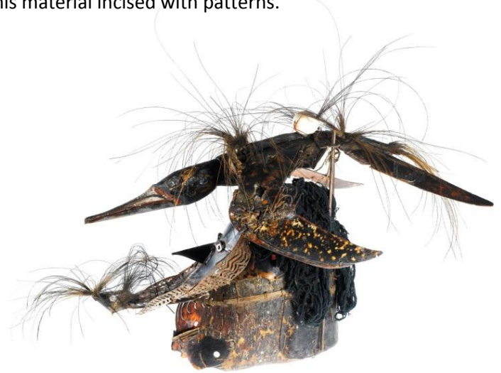
Dance mask of turtle shell with cassowary feathers and hair, Saibai, Torres Strait Islands, 19 th century, National Museums Scotland (A.1885.83)