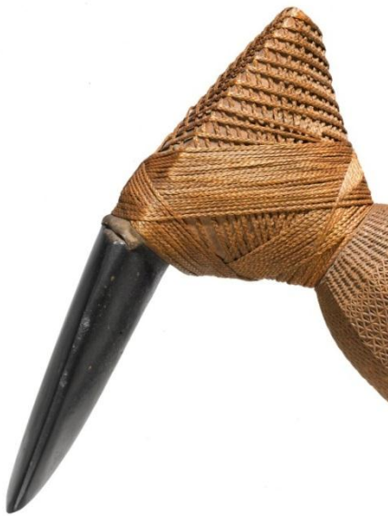
Coconut fibre binding on ceremonial adze, Cook Islands, National Museums Scotland (A.1956.1028)

Coconut fibre has a distinctive orange or copper colour. It is often found in the form of cordage used as a binding or a suspension cord and may be two sections twisted or three or more sections braided together.