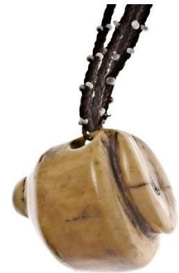
Carved whale tooth pendant on cord with attached glass trade beads - beads originated outside of the Pacific and were a valuable obtained through exchange, Fiji, National Museums Scotland (A.1924.779)