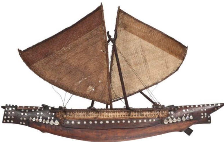
Canoe model with pearl shell inlay, Manihiki, Cook Islands, National Museums Scotland (A.1902.73)