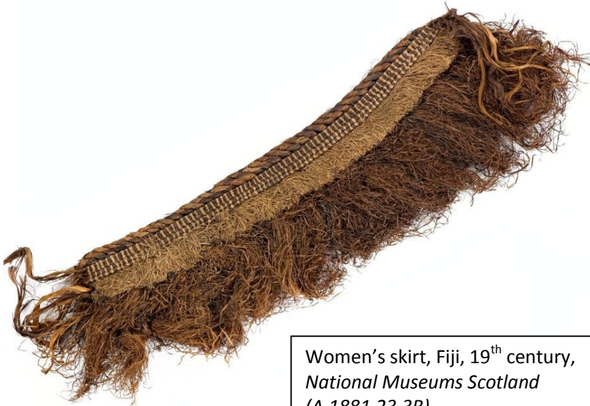
Women's skirt, Fiji, 19 th century, National Museums Scotland (A.1881.23.3B)

Hibiscus fibre is one of the main grasses used in Oceanic material. It is often shredded to make skirts. Different parts of the plant are used. For example, hibiscus bast, which comes from the outer bark of the plant, is used in banana fibre textiles from the Caroline Islands to create dark brown patterns.