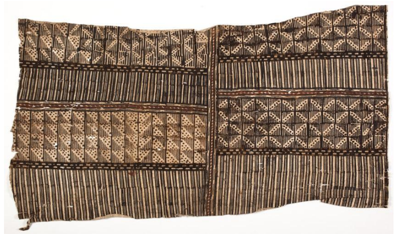
Barkcloth ( masi ), Fiji, late 19 th century, Perth Museum & Art Gallery, (1978.2376)