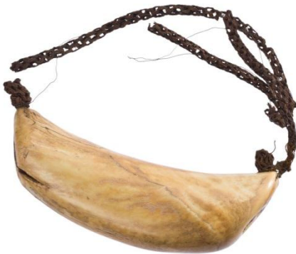
Ceremonial sperm whale tooth ( tabua ), Fiji, National Museums Scotland (A.1896.58)

Sperm whale teeth are used as a raw material, mainly in body adornments, in a number of places in the Pacific. The material is often referred to as whale ivory and its appearance is similar red ochre colour.