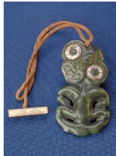
Hei tiki pendant of greenstone with eyes inlaid with haliotis shell (abalone; paua ), New Zealand, 19 th century, University of Aberdeen Museums (ABDUA: 4034)