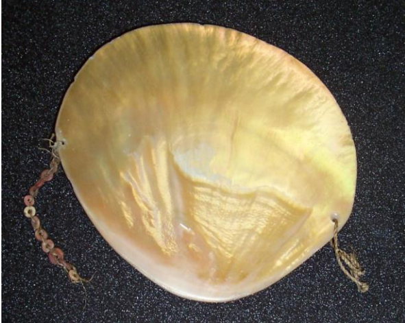
Gold lip shell with attachment of spondylus shell discs (pink coloured shell commonly seen on Melanesian artefacts), Papua New Guinea, 19 th century, National Museums Scotland (A.1882.91.77)