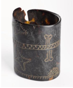
Arm ornament of turtle shell, Admiralty Islands, 19th century, National Museums Scotland (A.1898.439)

Turtles have significance in many parts of the Pacific. Historically, turtle meat was reserved for high ranking individuals and turtle shell was, and some places still is, a valuable material associated with wealth and status. It is recognisable by its mottled brown colour and hard shiny appearance. Turtle shell can be manipulated into shapes by first softening it using heat to make it more malleable. It is not uncommon to see this material incised with patterns.