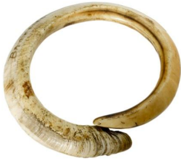
Arm ornament of boar tusk, Hawaiian Islands, National Museums Scotland (A.1956.1020)

The tusks of pigs continue to be valued in the Pacific today and are particularly associated with Papua New Guinea, Vanuatu, Solomon Islands and Fiji. Pigs have significance in ritual and ceremonial activities and the animals are prized possessions. Tusks that have curled to form a complete ring or more are more valuable due to the time and nurturing necessary for growth.