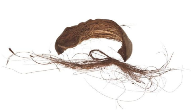
Section of coconut husk from Kiribati, National Museums Scotland (A.1917.51)

Fibres from different parts of the coconut are used as a raw material. It is not uncommon to see the term 'coir' used in museum documentation to describe coconut fibre. Specifically, coir is the raw material found between the hard internal shell and the outer coat of a coconut.