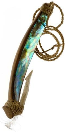
Fish hook with haliotis (abalone; paua ) shell, New Zealand, collected mid-19 th century, National Museums Scotland , (V.2007.300)

Also termed abalone, the inside of this shell has a distinct blue-tinged iridescent appearance. It is used in a number of Māori artefacts as inlay for eyes in wood carving, hei tiki figures, and other examples of taonga (Māori treasures). Haliotis is also used in composite Māori fish hooks, particularly as lining for a curved piece of wood which forms the body of the hook. The reflective nature of the shell means it acts as an effective lure. The Māori term for this haliotis shell is paua .