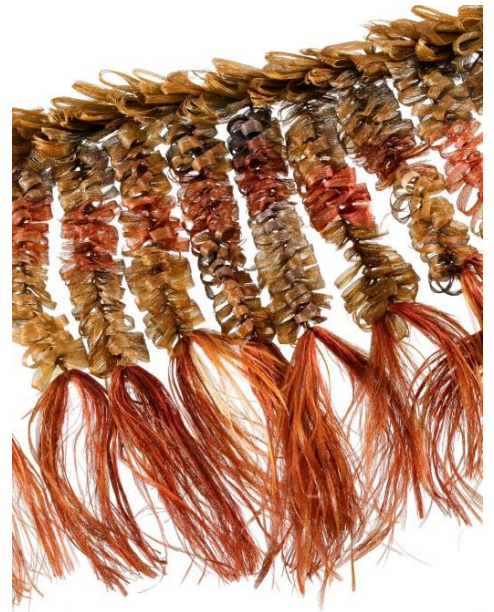
Detail of skirt made with dyed hibiscus bast, Samoa, National Museums Scotland (A.1897.188.3)