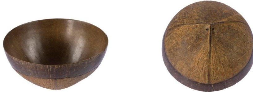
Coconut shell cup, Fiji, National Museums Scotland (A.1900.481)

Coconut shell has a distinctive in appearance. It is rich brown in colour flecked with lighter brown and is often worked to have a smooth finish. Shells can be split in two to make cups for domestic use as well as more formal occasions such as kava drinking ceremonies. Cups may be plain or carved depending on the provenance and use, but the material is still recognisable.