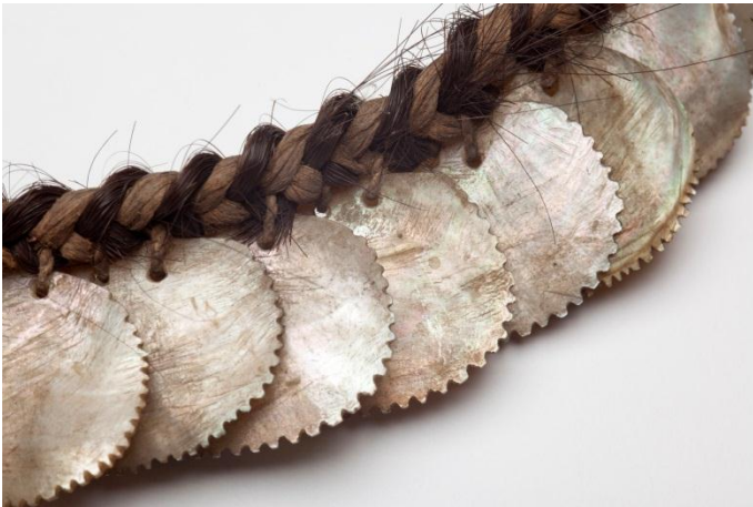
Detail of pearl shell neck ornament on cord of braided coconut fibre and human hair, Perth Museum & Art Gallery (1977.1712)

Pearl shell is used for decorative inlay as well as in dress and adornment. For the latter they can be cut or used whole as in breast ornaments. White lip oyster shell is used for elaborate inlay in the western Solomon Islands, in canoe models and bowls from Manihiki in the Cook Islands, and in artefacts from Palau in Micronesia. Gold lip oyster shell has a soft gold colour and is often seen worked into a crescent shape in Papua New Guinea and West Papua where it is used as a shell valuable in local exchange systems. This is called kina in Papua New Guinea, which has been the name for modern currency in the country since 1975. Gold lip shell is also used for breast ornaments in the Torres Strait Islands and the Solomon Islands. Black lip oyster shell has a dark edge and is more commonly found in artefacts from the Society Islands and surrounding areas.