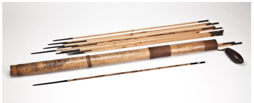
Quiver and arrows with stopper of an immature coconut, Tahiti, Society Islands, 18 th or early 19 th century, Perth Museum & Art Gallery (1978.173)