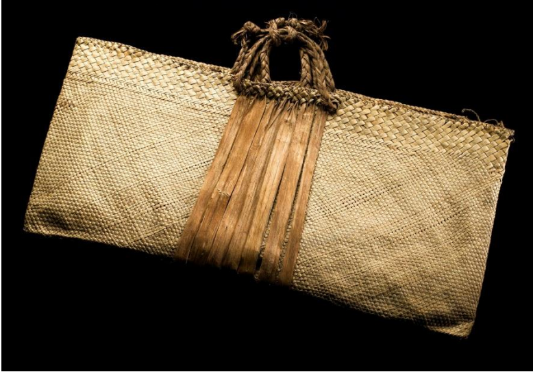
Basket of woven pandanus leaf, Efate, Vanuatu, National Museums Scotland (A.1889.550)

Different varieties of pandanus, also termed screw pine, grow across the Pacific. The plant is palm-like but not closely related. Pandanus leaves are commonly used in making baskets, skirts, mats and fans as well as being used for housing and medicine. The wide leaves will often be split for use in fine weaving.