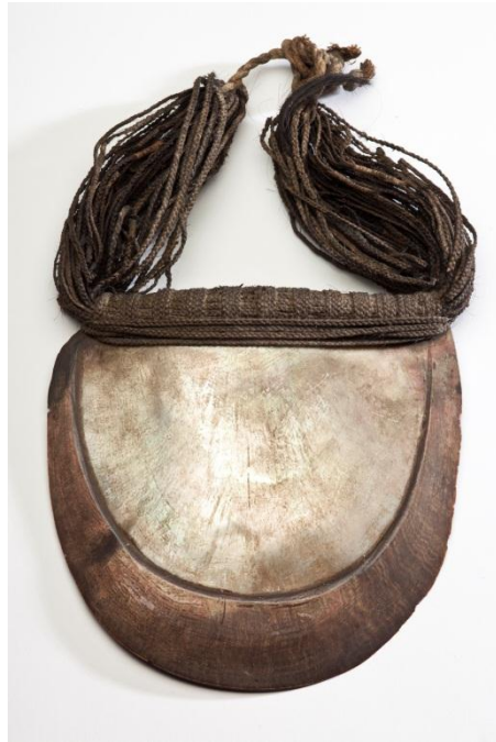
Black lip shell breast ornament, Society Islands, 18 th or early 19 th century, Perth Museum & art Gallery (1977.1417)