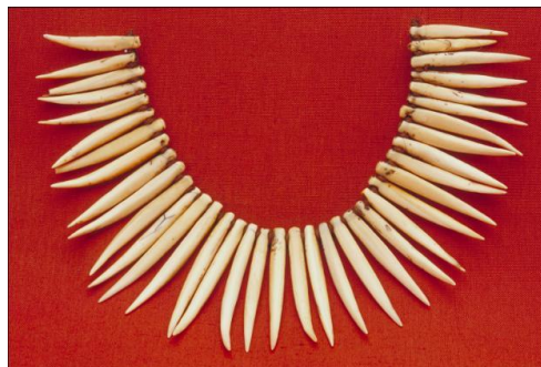
Neck ornament of split whale teeth, Fiji, University of Aberdeen Museums (ABDUA: 4583)