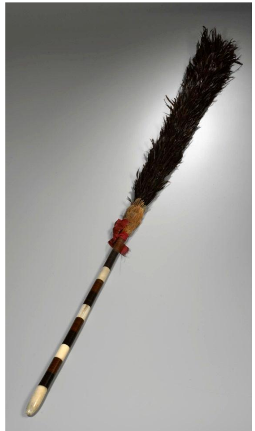
Fly whisk ( kahili ) with red trade cloth tied around handle, Hawaiian Islands, 19 th century, National Museums Scotland (A.1948.278)

Contact with Asia, Europe and elsewhere brought new materials to the Pacific islands. Both cloth and glass beads were seen as a valuable commodity for which islanders would exchange food and other goods. Red coloured cloth was particularly prized due to the association the colour had with status across the Pacific. Often cloth and beads have been added to artefacts and are indicative of the previous owner's wealth and power.