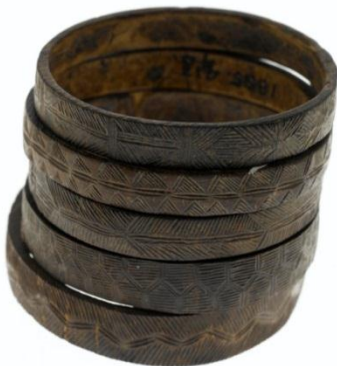
Carved coconut shell arm ornaments, south Vanuatu, 19th century, National Museums Scotland (A.1895.413.42)

The shell of a coconut is seen split into sections to make arm ornaments (as in Vanuatu) and cut into shapes to decorate larger items (such as on a Tahitian mourner's costume). Young or immature coconuts are much smaller and are used in a variety of ways such as for carved figures in the Gulf of Papua New Guinea and for practical purposes as a stopper on the end of a quiver from Tahiti.