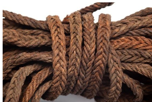
Detail of braided coconut fibre twine, Fiji, Perth Museum & Art Gallery (1977.1376)