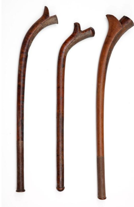
Clubs of Casuarina wood, Fiji, 19 th century, Perth Museum & Art Gallery

Providing a definitive identification for the type of wood used in Pacific artefacts can be challenging. Clubs, spears and other wooden artefacts from Polynesia are often given as being manufactured from Casuarina wood (specifically Casuarina equisetifolia ). This wood is also called ironwood and known as toa throughout Polynesia.