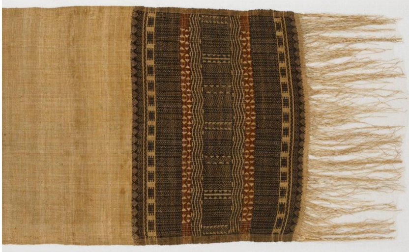
Detail of mat woven from banana fibre, Caroline Islands, National Museums Scotland (A.1899.320)

Shredded banana fibre has a distinctive golden sheen. Shredded banana fibre is used in making skirts although they are not as prevalent in museum collections as those made of hibiscus. Banana fibres are woven on a loom both in the Santa Cruz Islands to make bags and mats and across the Caroline Islands chain in Micronesia to make fine textiles.