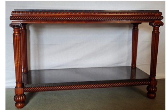
Rosewood, ash and black marble table, 1814, by William Trotter. © The Paxton Trust

Paxton Trust received a grant of £15,000 to support the purchase of a rosewood, ash and black marble table made by Scottish cabinet maker William Trotter (1772–1833). It was commissioned in 1813 as part of a suite of 40 pieces of furniture for Paxton House's new Regency extension. The Paxton Trust holds a Recognised Collection of National Significance which includes furniture by Thomas Chippendale the Elder and Younger. Displays at Paxton tell the story of the history of the house and its outstanding furniture commissions as well as its links to transatlantic slavery through the Home family's ownership of plantations in the Caribbean.