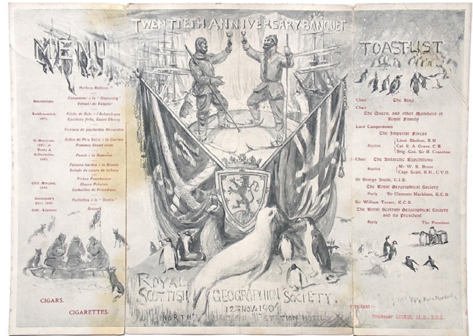
Programme, menu and toast list, Royal Scottish Geographical Society 20th anniversary banquet to celebrate the National Antarctic Expeditions, 12 November 1904.