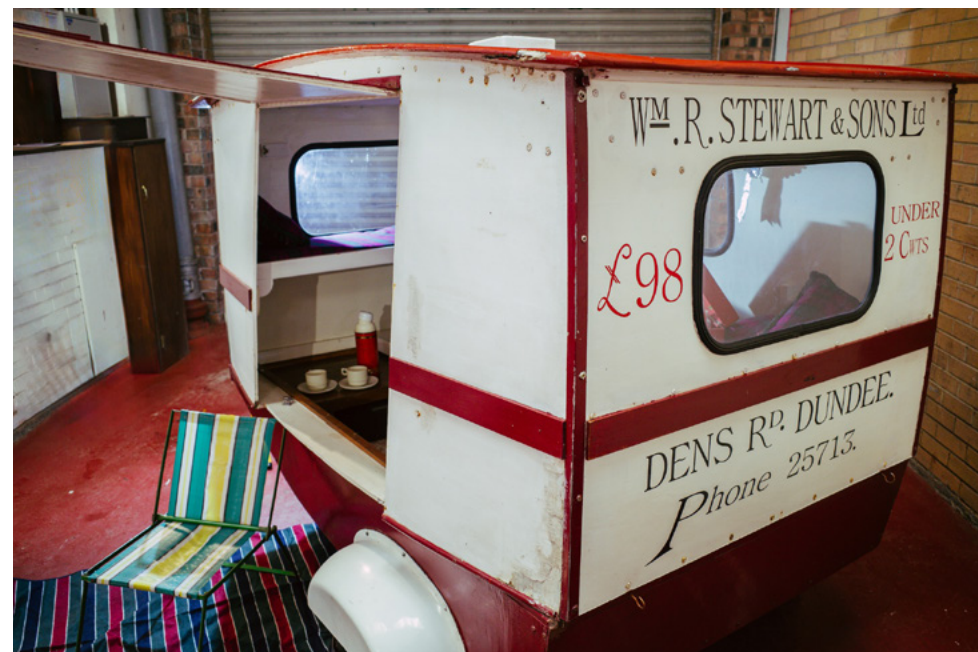
Nutshell compact folding caravan made in the 1950s by Stewarts Hacklemakers, Dundee.

the transport heritage of Dundee and the surrounding area. A new museum is under development in the city's Maryfield Tram Depot where the caravan will eventually be displayed.