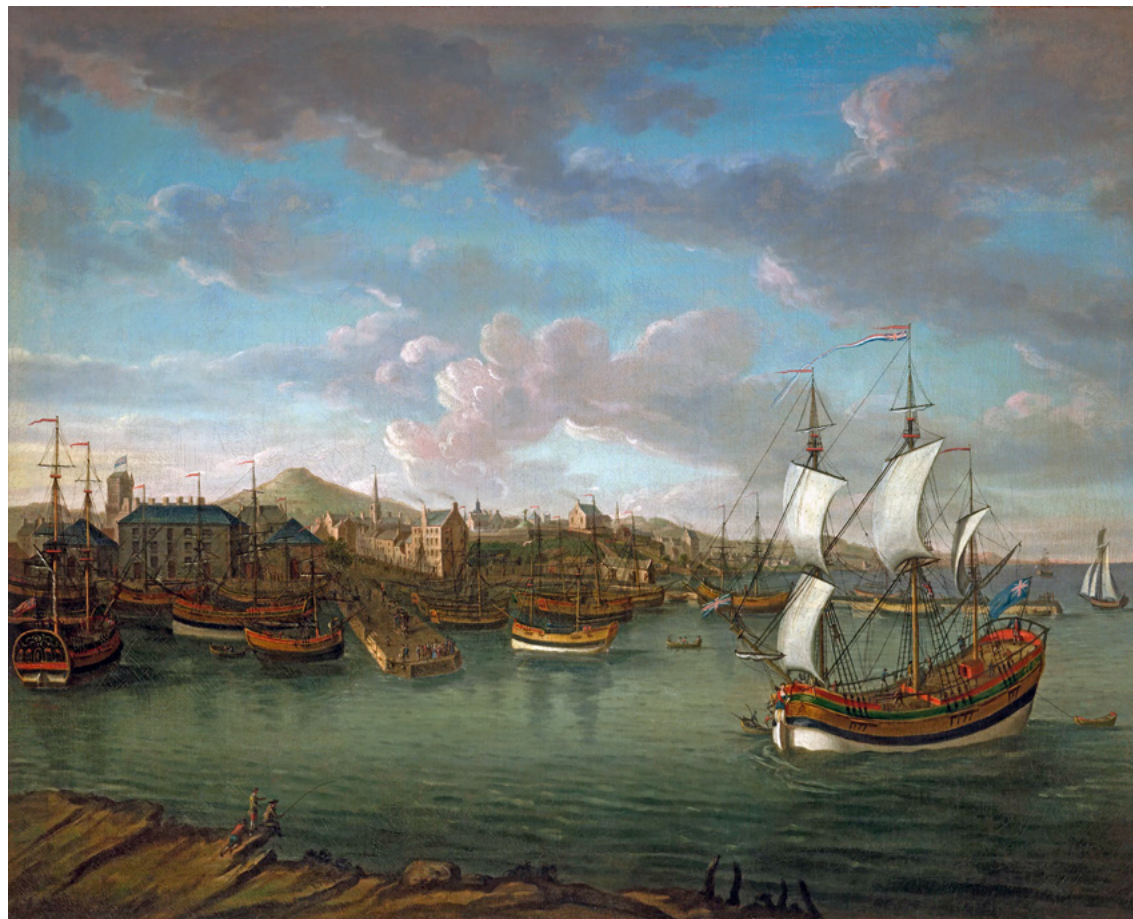
Oil painting on canvas, Dundee from the Harbour, c1776, artist unknown.

Glasgow Life received a grant of £15,000 to acquire an oil painting on hardboard, Cowcaddens Streetscape in the Fifties , 1964, by Alasdair Gray (1934–2019). One of the most significant Scottish artists of the postwar era, Gray was a prolific poet, playwright, novelist, painter and printmaker whose subject was Glasgow and its people. This large-scale painting, which Gray described as his 'best big oil painting', was included in his retrospective exhibition at Kelvingrove Art Gallery and Museum in 2014. While Glasgow Museums holds other works by Gray, this is the first major oil painting to enter the collection.