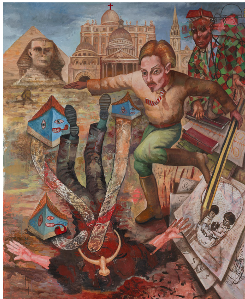
Oil painting on canvas, Portrait of the Lost Travelogue Writer , 2006-07, by Steven Campbell. City Art Centre, Museums & Galleries Edinburgh. © The Artist's Estate.

Museums and Galleries Edinburgh's fine art collection is a Recognised Collection of National Significance which traces the development of Scottish art from the 17th century to the present. The Fund contributed to the acquisition of works by five modern and contemporary artists. They included a grant of £8,000 to support the acquisition of an oil painting on canvas, Portrait of the Lost Travelogue Writer , 2006–07, by Steven Campbell (1953–2007), one of the