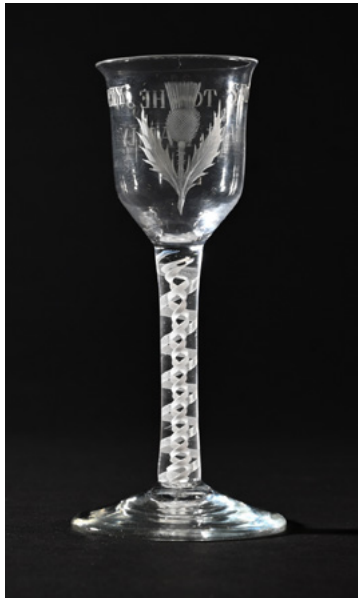
Eighteenth-century Jacobite wineglass.

Orkney Museums received a grant of £3,659 to acquire a silver-plated tureen salvaged from the German High Seas Fleet which was scuttled at Scapa Flow following the end of the