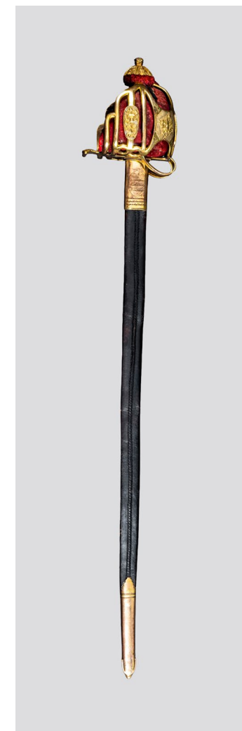
Basket-hilted backsword © The Museum of the Isles, Armadale Castle, Isle of Skye

The Museum of the Isles acquired a rare basket-hilted backsword presented by clansmen in 1802 to the 19th Chief of Keppoch, Alasdair na Ceapach. The collection represents the history of Clan Donald which has six main branches. The museum holds comparatively few objects from the Keppoch line which fell dormant in 1848, forty years after Keppoch's death. The basket-hilted sword was an essential part of the military culture of 18th-century clan society, a symbol of the martial prowess and traditional authority of the clan chief. Keppoch, who enlisted in the army at the age of 20 and had a distinguished military career, embodied these qualities. He was wounded at the siege of Toulon in 1793, served in the West Indies, and in 1797 was given a captaincy in the First Regiment of Foot, the Royal Scots. His regiment was with the Egyptian Campaign of 1801 and he was again wounded in the Battle of Aboukir. In 1805 he was promoted to Major. He retired soon afterwards and went to Jamaica where he died in 1808. Alasdair Keppoch never married and the representation of the family devolved to his only brother, Richard.