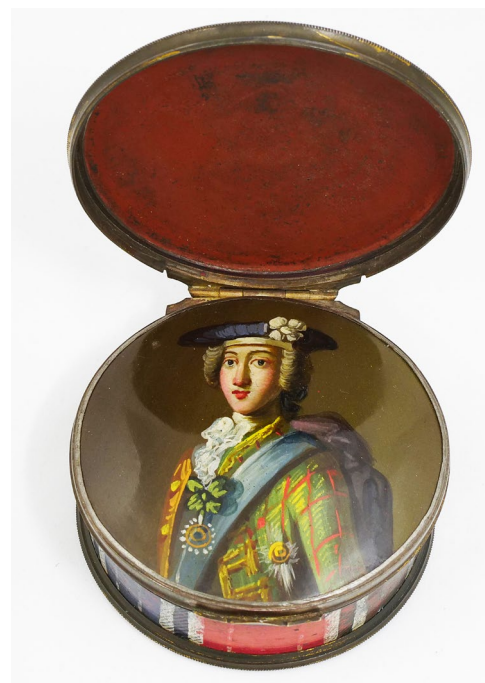
Jacobite snuff box

West Highland Museum acquired at auction a hidden portrait Jacobite snuff box dating from c1750. The museum holds extensive Jacobite collections including fine art, glass, weapons, medallions and memorabilia as well as a Jacobite archive. The snuff box is an example of the secrecy and symbolism employed by supporters of the Jacobite cause to express their allegiance to the Stuart dynasty. Appearing to be an ordinary snuff box with tartan decoration, its hidden double lid opens to reveal a finely enamelled portrait of Prince Charles Edward Stuart, based on the engraving by Sir Robert Strange (1721–1792).