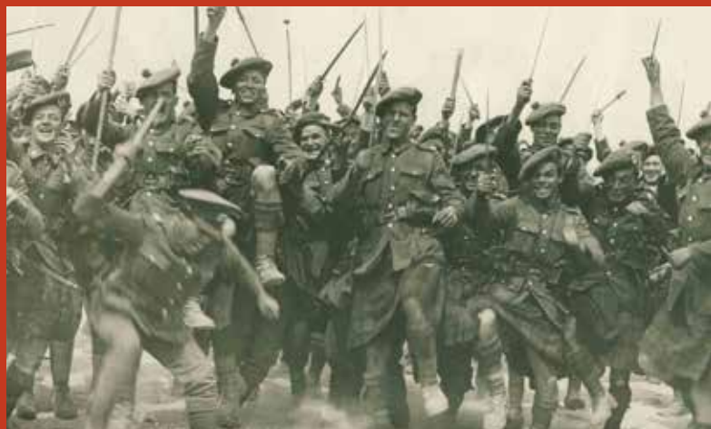
4th South African Infantry (South African Scottish)

More than 33,000 people explored the stories of the Scottish diaspora and the Commonwealth nations during the First World War at the National Museum of Scotland during summer 2014. Common Cause: Commonwealth Scots and the Great War included poignant objects borrowed from partners in Canada, South Africa, Australia and New Zealand. The exhibition was supported by the Scottish Government as part of the Year of Homecoming 2014.