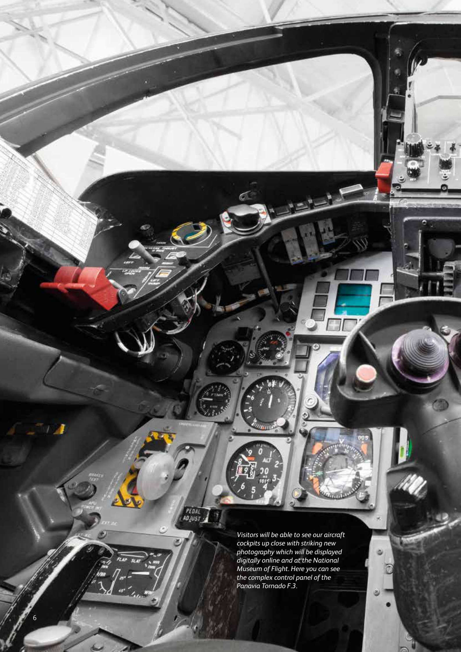
Visitors will be able to see our aircraft cockpits up close with striking new photography which will be displayed digitally online and at the National Museum of Flight. Here you can see the complex control panel of the Panavia Tornado F.3.