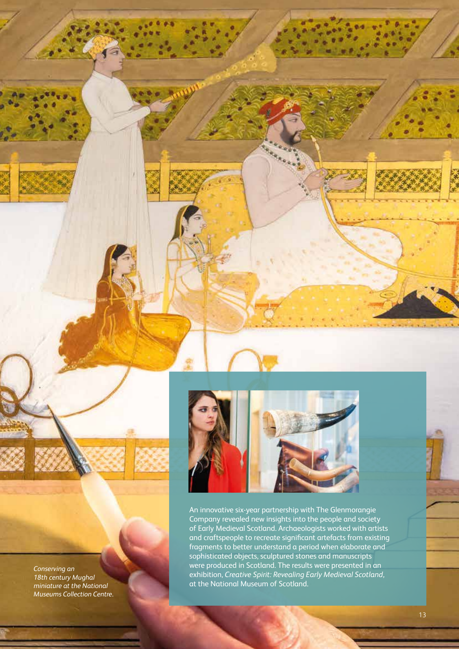
Conserving an 18th century Mughal miniature at the National Museums Collection Centre.